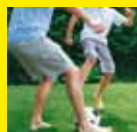
High traffic areas