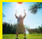
Dry, sunny areas

Our unique combination of coir, grass seed and Miracle-Gro plant food provides the optimum environment to grow grass anywhere - even on concrete!