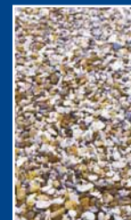
Before Treatment After Treatment

Prevents re-invasion by seedlings for up to 3 months