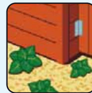
WASTE GROUND AROUND SHEDS

** Do not use Pathclear Weedkiller PC on impermeable surfaces such as concrete, tarmac, decking and paved areas, or on any other surface, which is underlaid with concrete, cement or any other impermeable material.