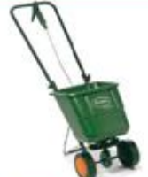
EasyGreen Rotary Spreader - SETTING 26½