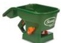
HandyGreen Hand Held Spreader - SETTING 3