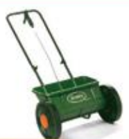
EvenGreen Drop Spreader - SETTING 6