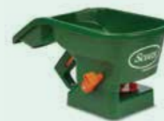
HandyGreen Hand Held Spreader - SETTING 3