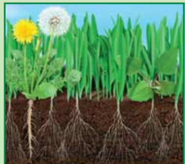
ONE ANNUAL FEEDING IN EARLY SPRING

Apply anytime of year. For best results feed three times per year.