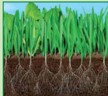
SECOND ANNUAL FEEDING IN EARLY SUMMER