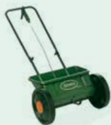
EvenGreen Drop Spreader - SETTING 6