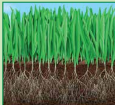
THIRD ANNUAL FEEDING IN AUTUMN