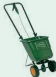
EasyGreen Rotary Spreader - SETTING 26½