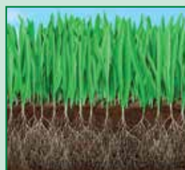
THIRD ANNUAL FEEDING IN AUTUMN