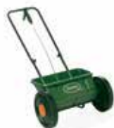
EvenGreen Drop Spreader - SETTING 5¼