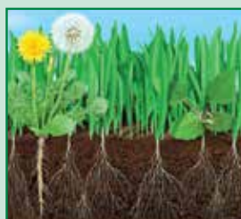
ONE ANNUAL FEEDING IN EARLY SPRING

Apply anytime of year. For best results feed three times per year.