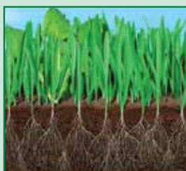
SECOND ANNUAL FEEDING IN EARLY SUMMER