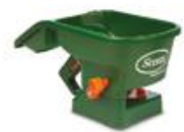
HandyGreen Hand Held Spreader - SETTING 5