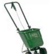
EasyGreen Rotary Spreader - SETTING 27