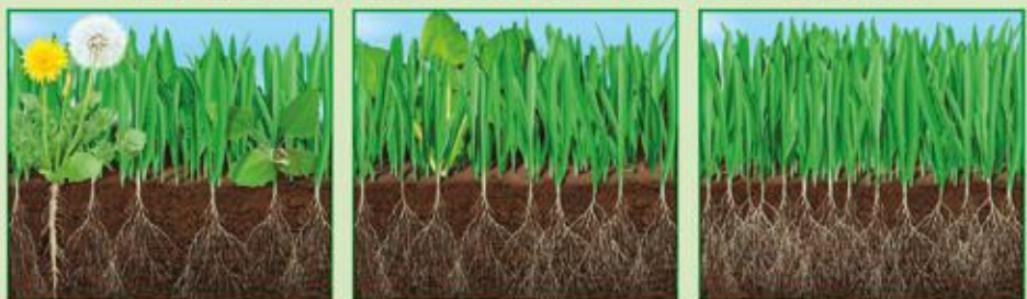
ONE ANNUAL FEEDING IN EARLY SPRING SECOND ANNUAL FEEDING IN EARLY SUMMER THIRD ANNUAL FEEDING IN AUTUMN

Apply anytime of year. For best results feed three times per year.