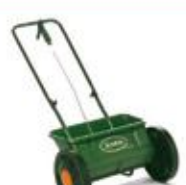
EvenGreen Drop Spreader - SETTING 5%