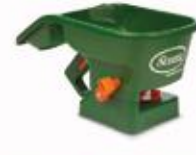
HandyGreen Hand Held Spreader - SETTING 3