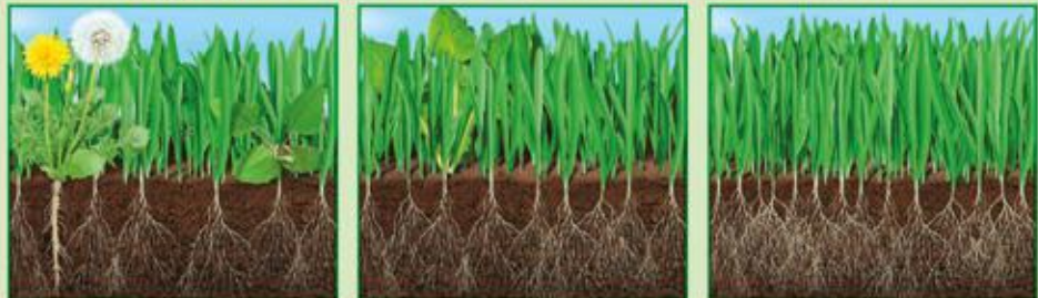
ONE ANNUAL FEEDING IN EARLY SPRING

Apply anytime of year. For best results feed three times per year.