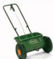
EvenGreen Drop Spreader - SETTING 6