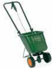
EasyGreen Rotary Spreader - SETTING 27