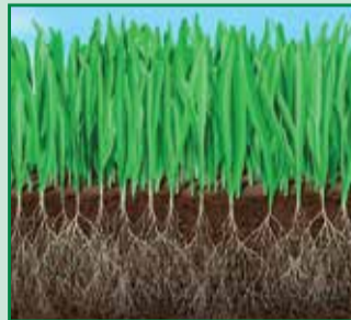
THIRD ANNUAL FEEDING IN AUTUMN