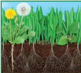
ONE ANNUAL FEEDING IN EARLY SPRING

Apply anytime of year. For best results feed three times per year.