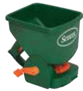
Easy HandHeld Spreader - SETTING 4

NOTE: Setting 4 on the Easy HandHeld spreader applies half the recommended rate. If using the Easy HandHeld, move over the entire area in one direction at a slow, steady walking pace then repeat application in a perpendicular direction to give full, even coverage.