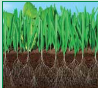
SECOND ANNUAL FEEDING IN EARLY SUMMER