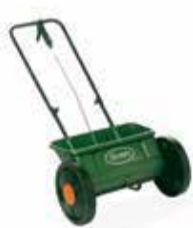
EvenGreen Drop Spreader - SETTING 3