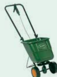
EasyGreen Rotary Spreader - SETTING 24½