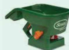
HandyGreen Hand Held Spreader - SETTING 3