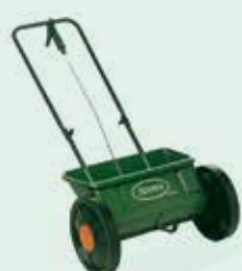
EvenGreen Drop Spreader - SETTING 6