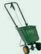
EasyGreen Rotary Spreader - SETTING 2½