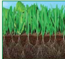
SECOND ANNUAL FEEDING IN EARLY SUMMER