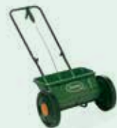
EvenGreen Drop Spreader - SETTING 6