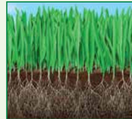
THIRD ANNUAL FEEDING IN AUTUMN