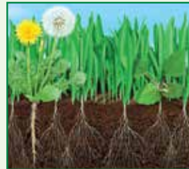
ONE ANNUAL FEEDING IN EARLY SPRING

Apply anytime of year. For best results feed three times per year.