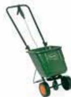
EasyGreen Rotary Spreader - SETTING 25