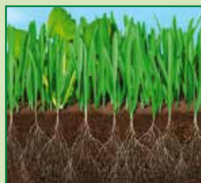
SECOND ANNUAL FEEDING IN EARLY SUMMER