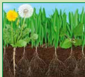
ONE ANNUAL FEEDING IN EARLY SPRING

Apply anytime of year. For best results feed three times per year.