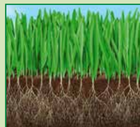
THIRD ANNUAL FEEDING IN AUTUMN