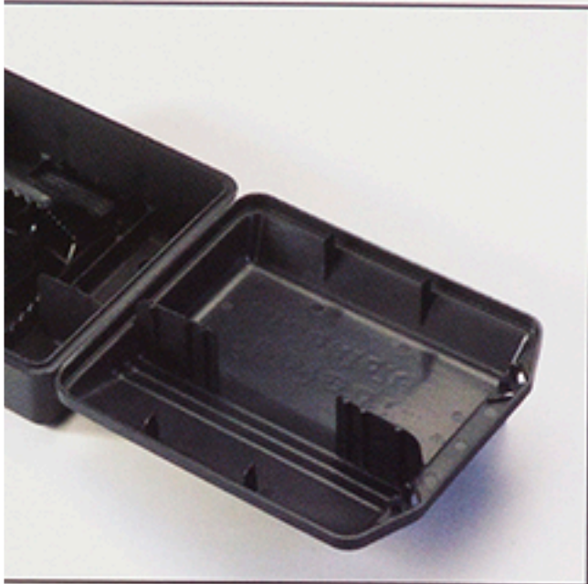
Mouse Snap Traps*