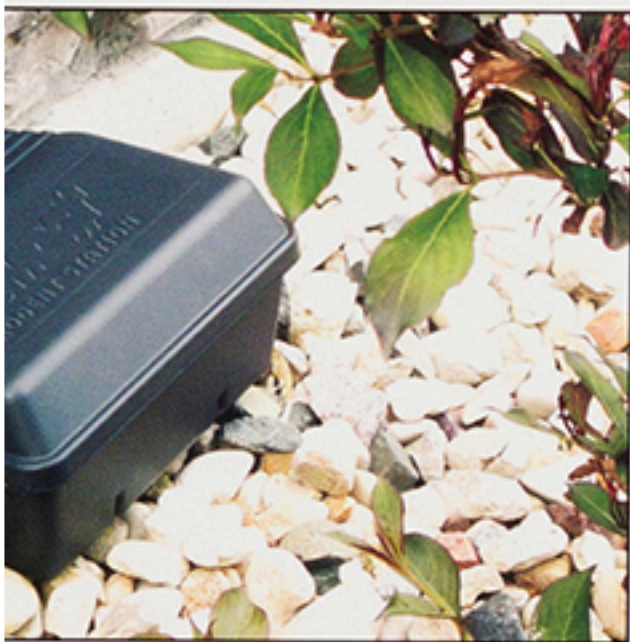
Use Indoors or Out