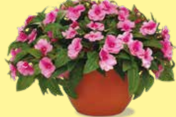
Miracle-Gro All Purpose Enriched Compost

** Trials prove that Miracle-Gro All Purpose Enriched Compost grows plants twice as big as ordinary garden soil.