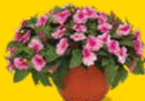
Fed regularly with Miracle-Gro® Plant Food