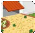
Gravel areas, paths and drives