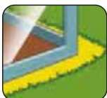
Around sheds and greenhouses