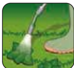
Killing old lawns before re-seeding or turfing

*Providing they are established, with woody bark. Take care to avoid drift!