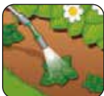
Ground clearance before autumn or spring digging