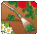
Around the base of roses, ornamental shrubs, trees and under hedges*