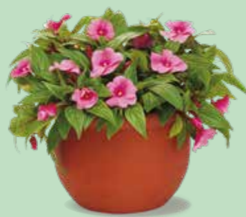
Ordinary garden soil

Grows plants twice as big... guaranteed!**