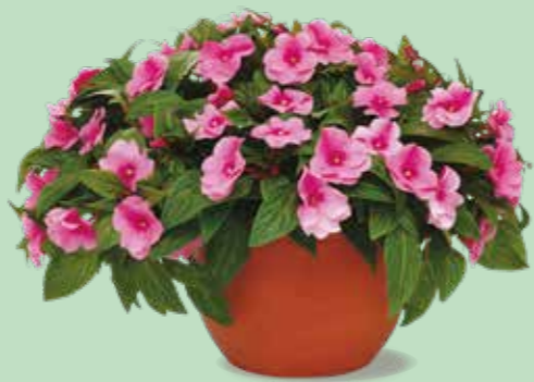
Miracle-Gro Peat Free All Purpose Enriched Compost

** Trials prove that Miracle-Gro Peat Free All Purpose Enriched Compost grows plants twice as big as ordinary garden soil.