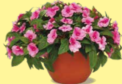
Miracle-Gro All Purpose Enriched Compost

** Trials prove that Miracle-Gro All Purpose Enriched Compost grows plants twice as big as ordinary garden soil.