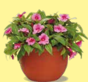
Ordinary garden soil

Grows plants twice as big... guaranteed!**