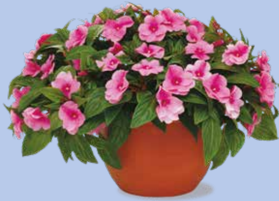
Miracle-Gro Moisture Control Enriched Compost - Pots & Baskets

** Trials prove that Miracle-Gro Moisture Control Enriched Compost - Pots & Baskets grows plants twice as big as ordinary garden soil.