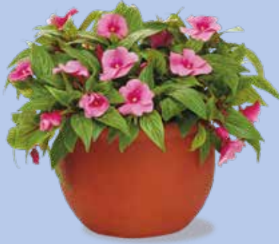
Ordinary garden soil

Grows plants twice as big... guaranteed!**