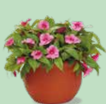
Ordinary garden soil

Grows plants twice as big... guaranteed!**