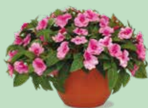
Miracle-Gro® Moisture Control™ Enriched Compost Pots & Baskets