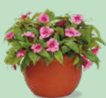
Ordinary garden soil

Grows plants twice as big... guaranteed!**