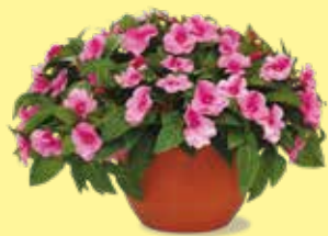
Miracle-Gro® Potting Mix Root Boosting Compost