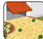
Gravel areas, paths and drives