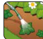
Ground clearance before autumn or spring digging