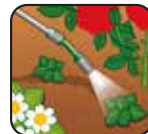
Around the base of roses, ornamental shrubs, trees and under hedges**