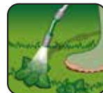
Killing old lawns before reseeded or turfing

** Providing they are established, with woody bark. Take care to avoid drift!