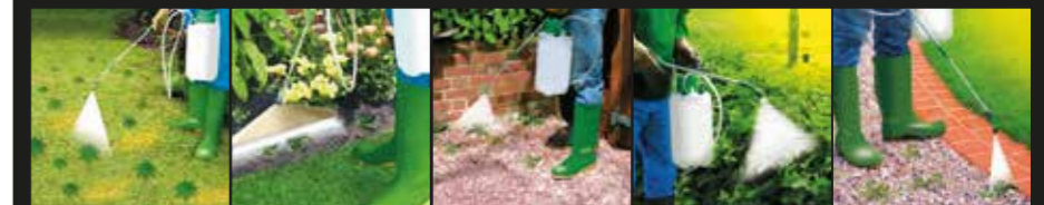
Weeding near roses, trees and ornamentals with pressure sprayer

Poisons information: For information or to report a poisoning incident in Ireland, contact the National Poisons Information Centre (01 809 2166), retain the label for reference.